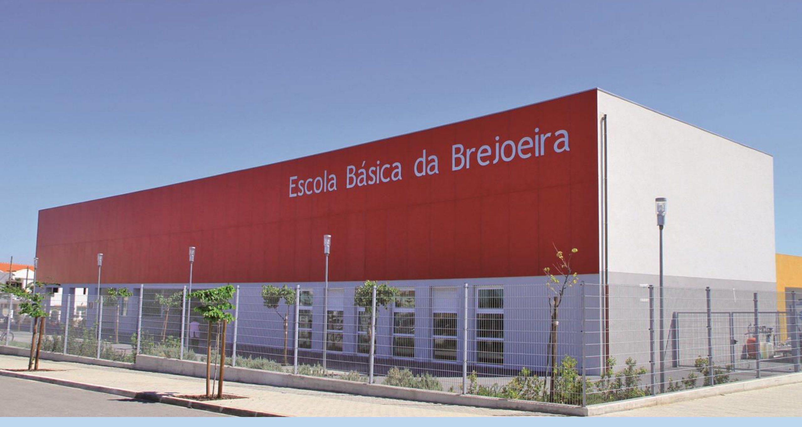
BREJOEIRA ELEMENTARY SCHOOL