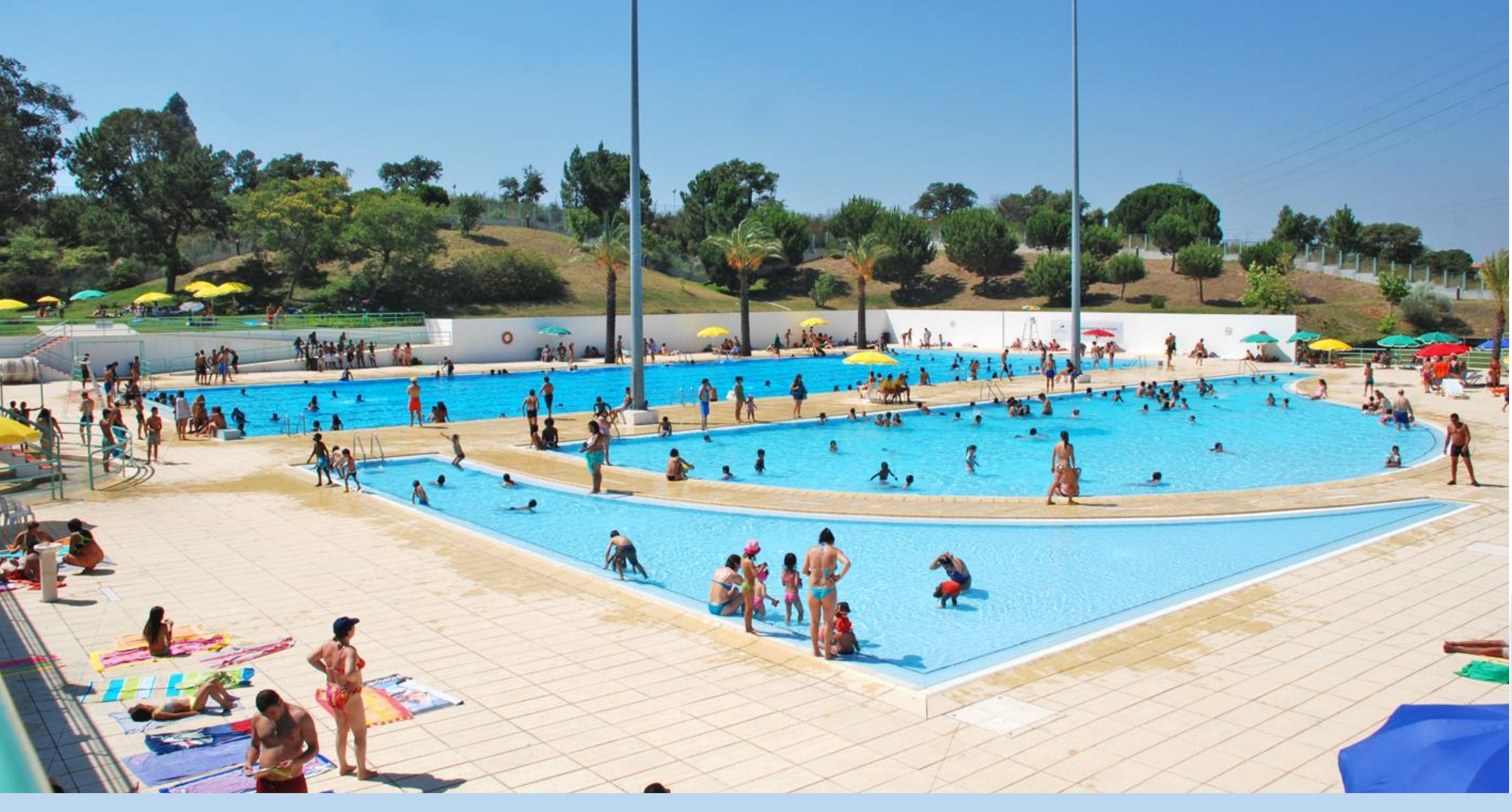
RENOVATION AND IMPROVEMENT OF THE MUNICIPAL SWIMMING POOL COMPLEX