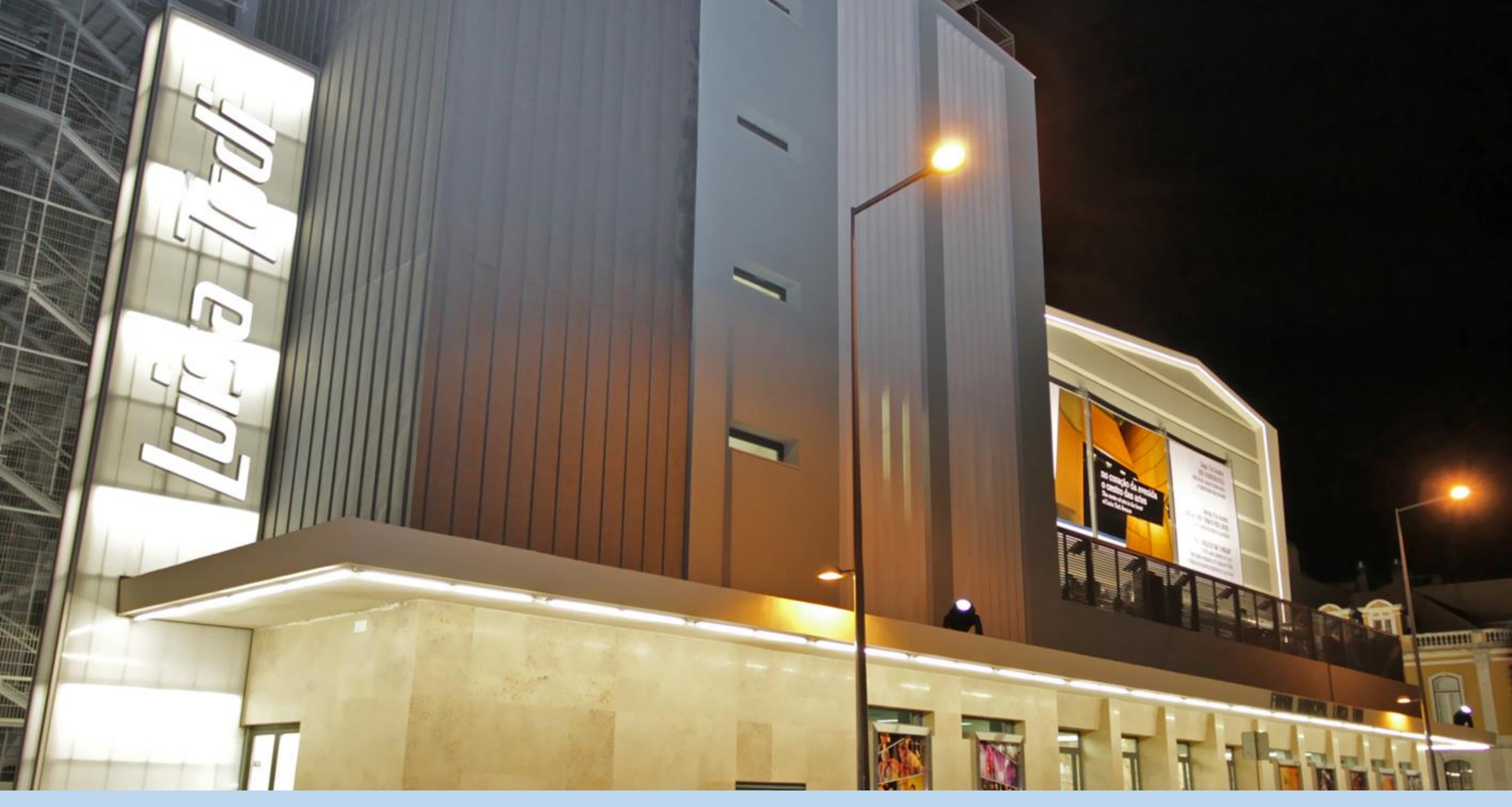
LUISA TODI MUNICIPAL FORUM (EXPANSION AND MODERNIZATION OF THE CONCERT HALL)