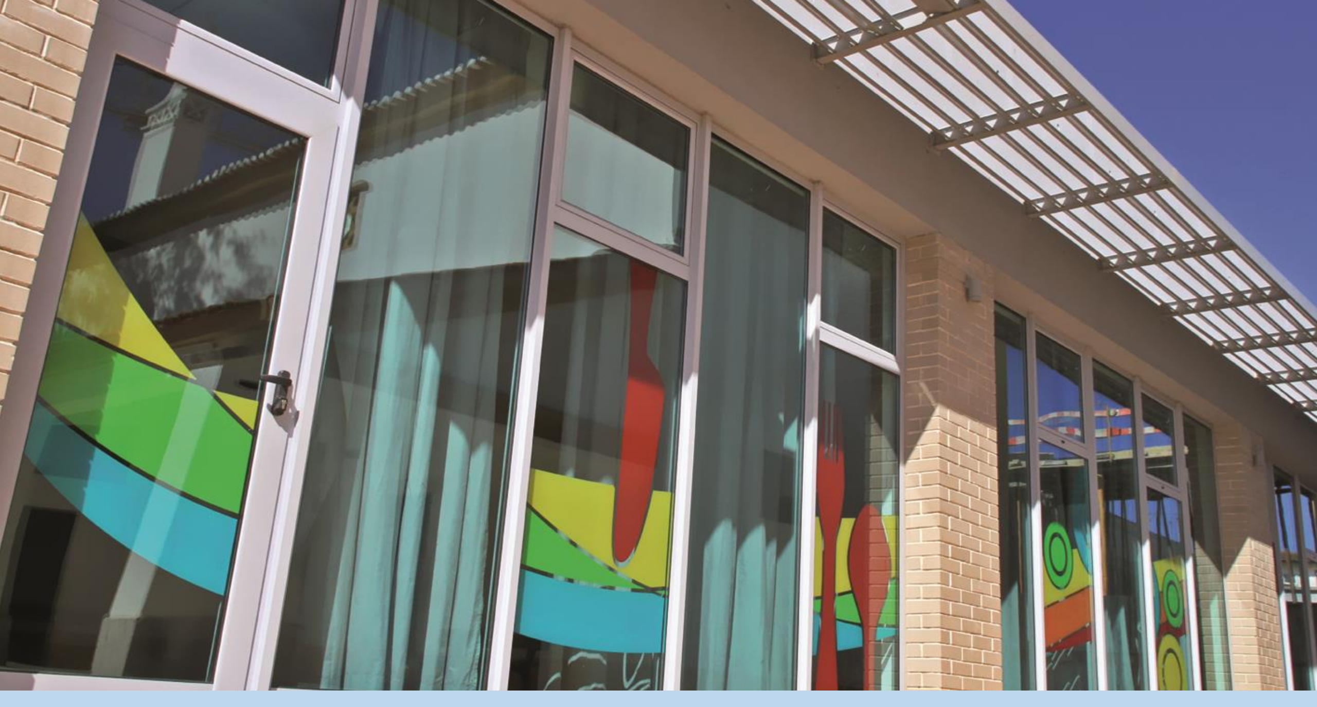
AFONSO COSTA ELEMENTARY SCHOOL