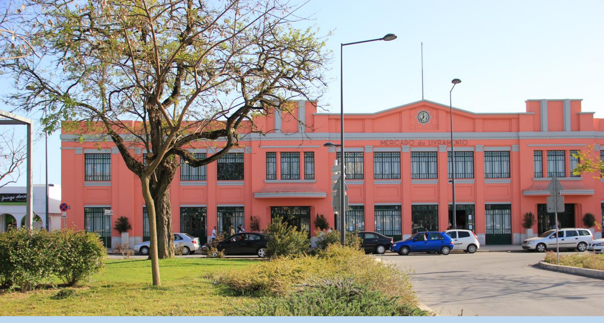
UPGRADING AND MODERNIZATION OF THE MERCADO DO LIVRAMENTO (MARKET)