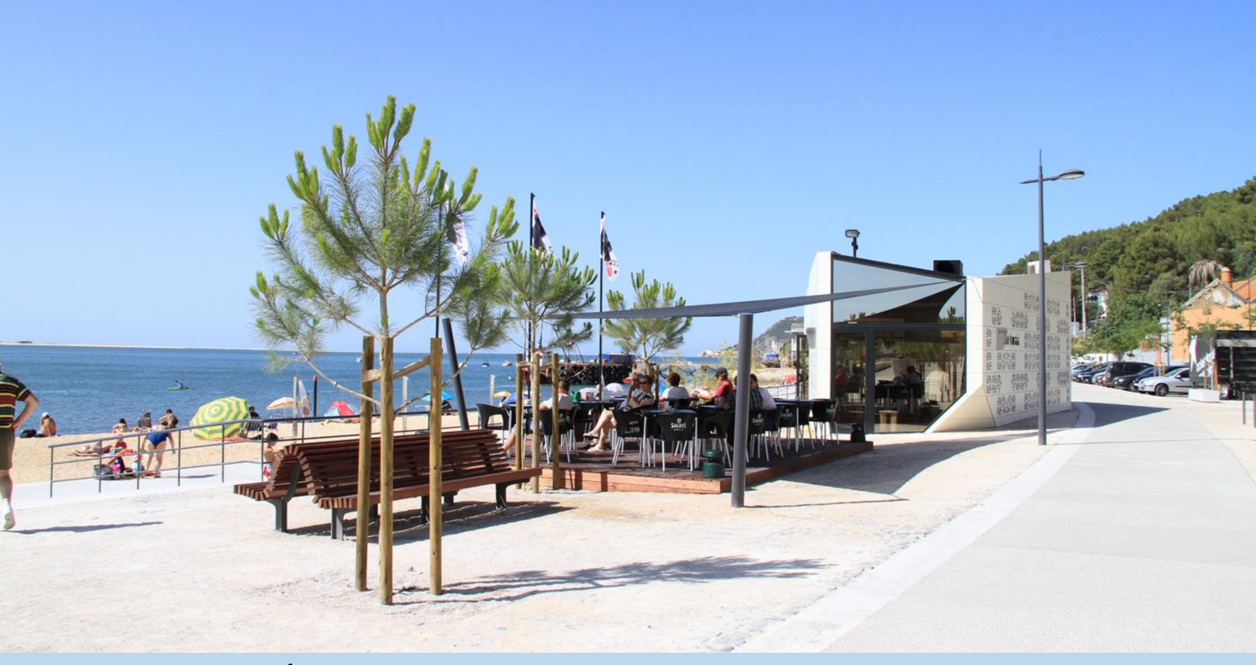
PRAIA DA SAÚDE (URBAN BEACH) - CONVERSION OF THE WESTERN RIVERSIDE AREA