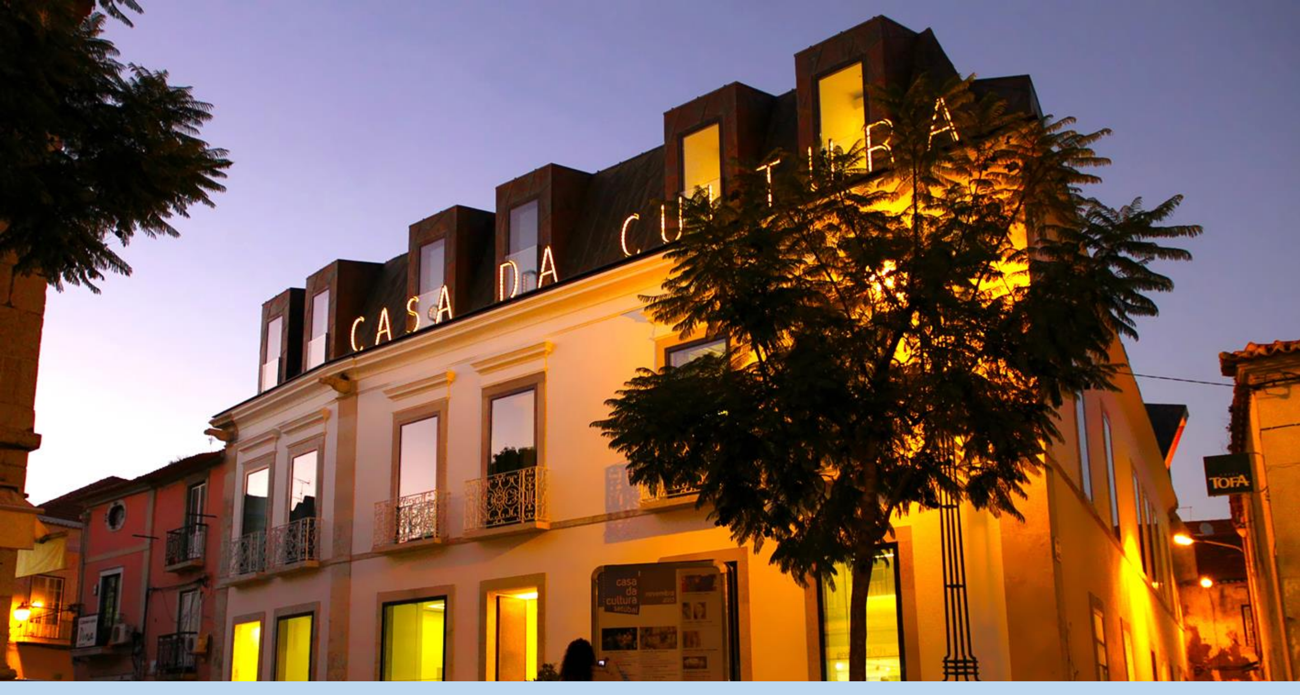
INSTALLATION OF CASA DA CULTURA (HOUSE OF CULTURE)