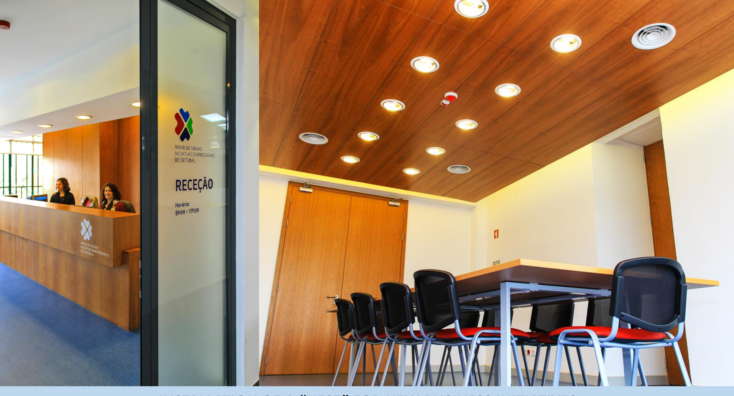
INSTALLATION OF A "NEST" FOR NEW BUSINESS INITIATIVES