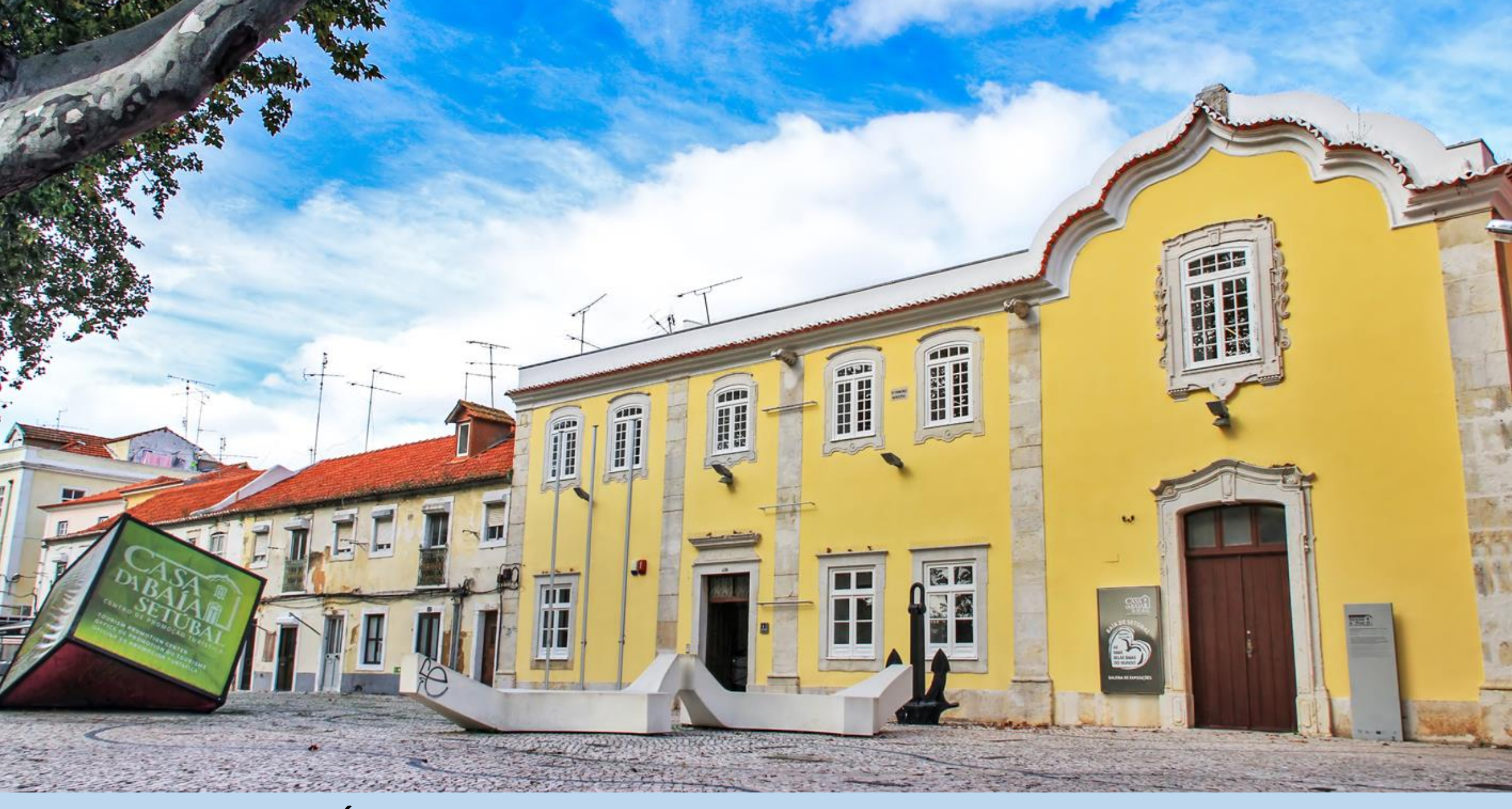
CASA DA BAÍA ( HOUSE OF THE BAY) – MUNICIPAL TOURISM PROMOTION CENTRE