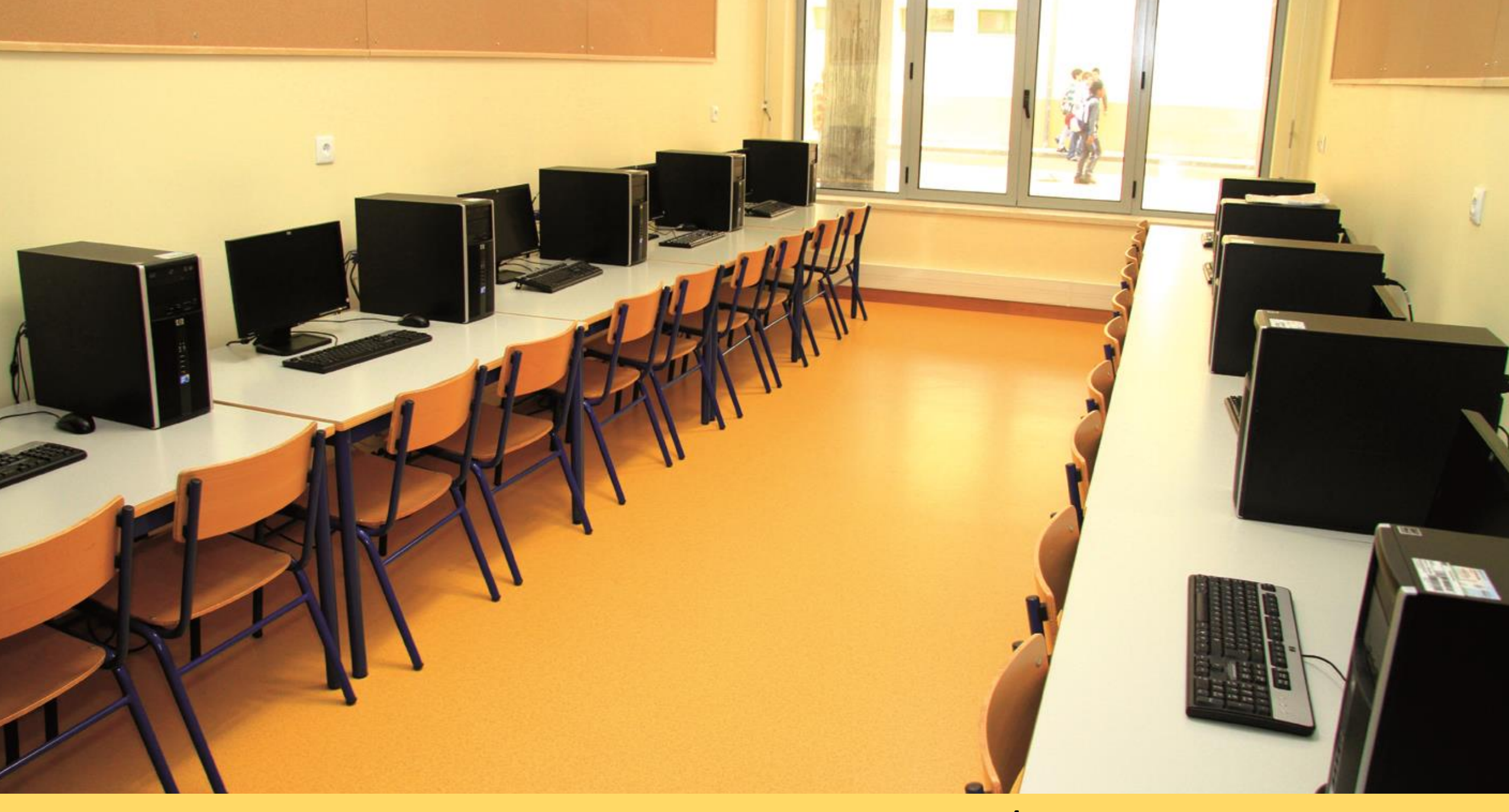
EQUIPMENT OF SCHOOLS WITH COMPUTERS AND INTERNET/INTRANET CONNECTION